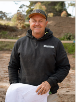
Jock Concrete Specialist